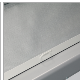
Rear night curtain to maintain temperature