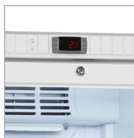
Thermostat with audible and external alarm