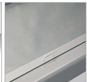
Rear night curtain to maintain temperature