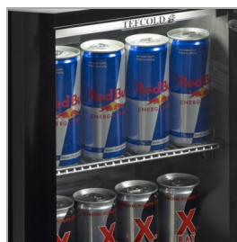
Designed for Energy-cans