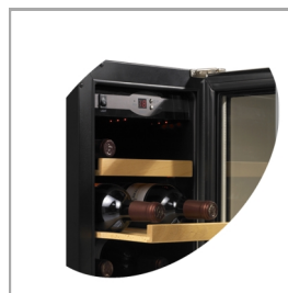
Wooden drawing shelves