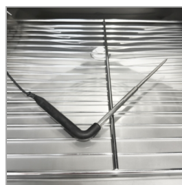
Core sensor included