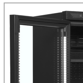
LED light inside door frame