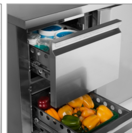
Drawers available as separate kit