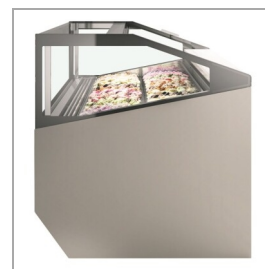
Glass end walls as standard