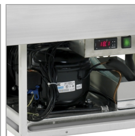
Automatic evaporation of defrost water