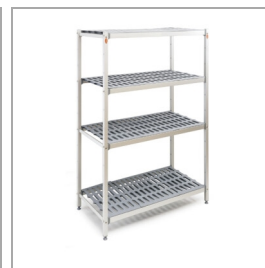
Shelf as accessory