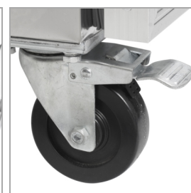
Strong castors as option