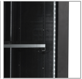
LED light inside door frame