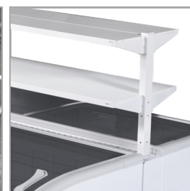
Promotional shelves as accessory