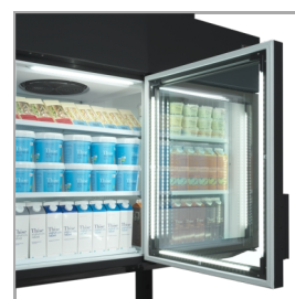
LED light inside door frame