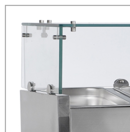
Glass structure for protection of food