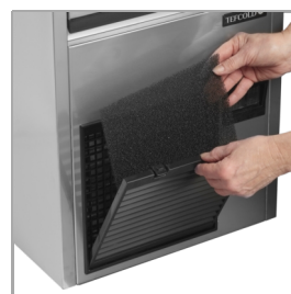
Easy to clean condenser filter