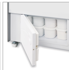
Easy access storage compartment