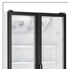
Full height doors