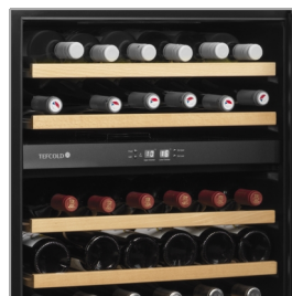
Wooden drawing shelves