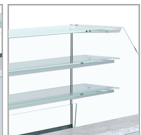
LED light under each shelf