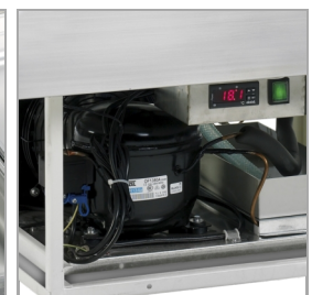
Automatic evaporation of defrost water