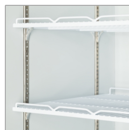
Adjustable shelves behind each door