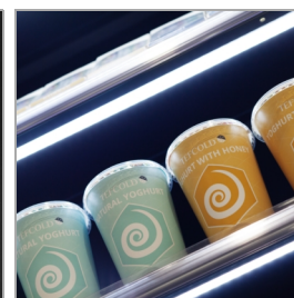
Display with a button for LED light under each shelf