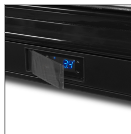
Protective thermostat cover