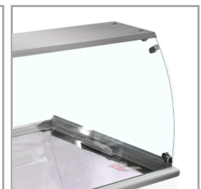
Curved glass for nice presentation