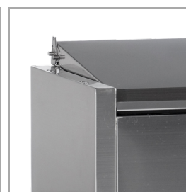
Stainless steel lid for protection of food