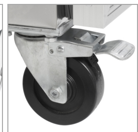
Strong wheels as option