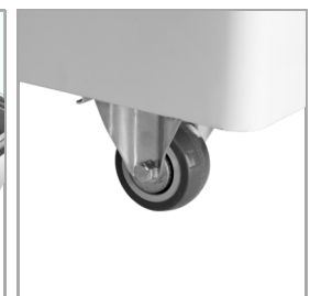
Castors with and without brake