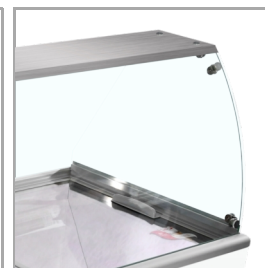
Curved glass for nice presentation