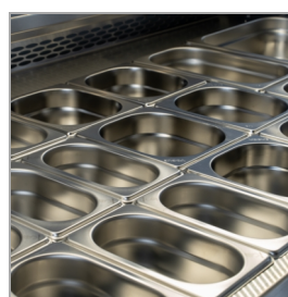
Designed for GN1/1 pans, not supplied