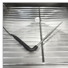
Core sensor included