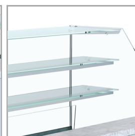
LED light under each shelf