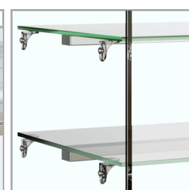
Detail image of shelf