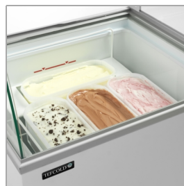
Scooping basket option