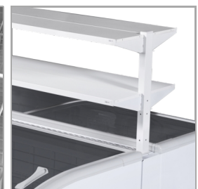
Promotional shelves as accessory